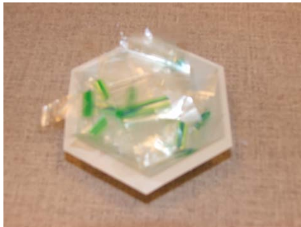
Figure 2: Samples of 2x2 cm cut Plastic Bags for degradation experiment.