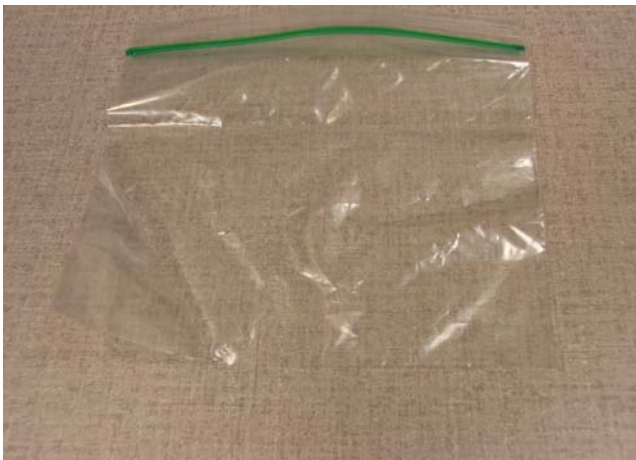
Figure 1: Samples of Plastic Bag

Testing was performed on plastic bags. The photograph in Figure 2 shows the plastic bag samples cut up in to small pieces of 2x2 cm.